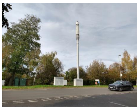
5G Masts on Kings Hedges Road and on entrance to Fen Ditton